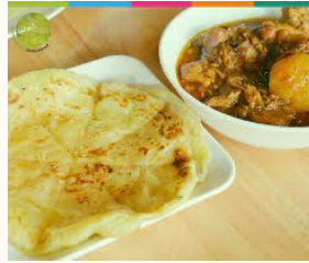
Curry and roti