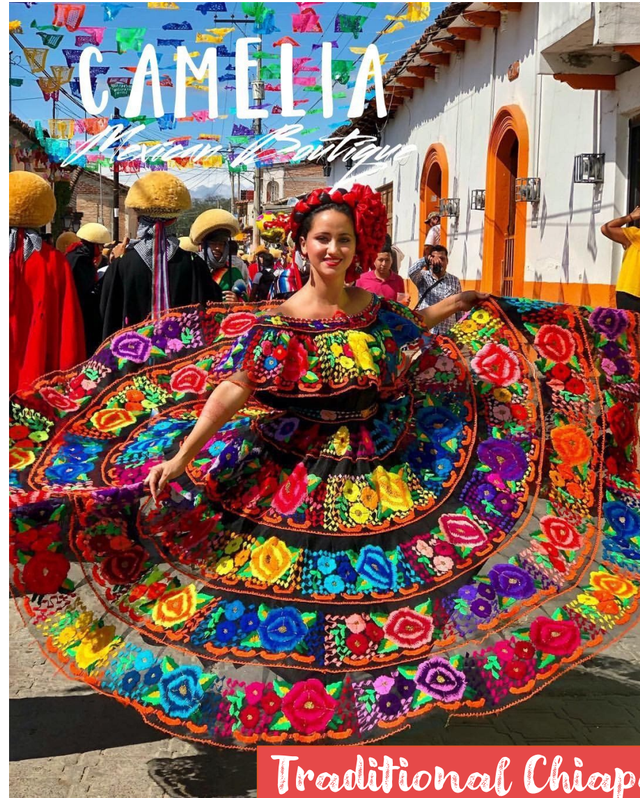
Traditional Chiapas dress from southeastern Mexico