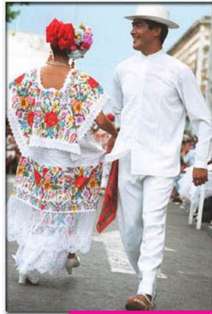
Traditional Dress & outfit Yucatan, southwest Mexico