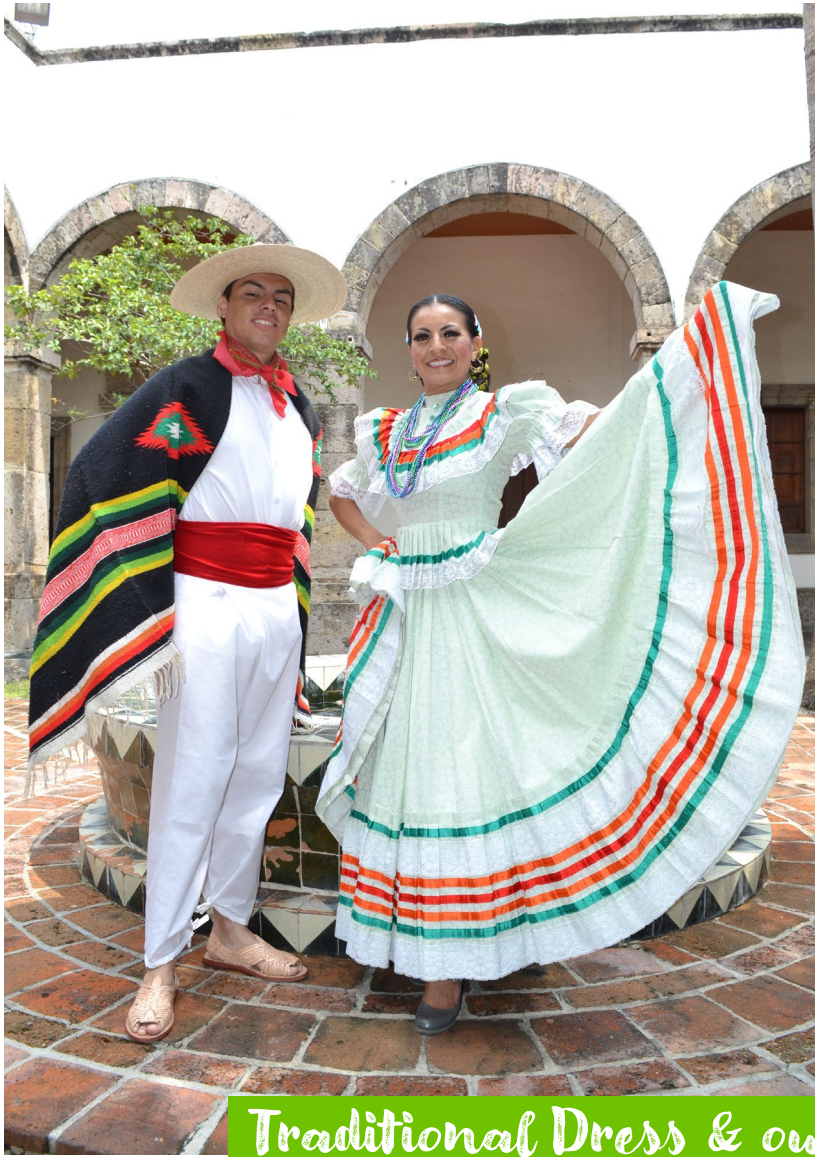
Traditional Dress & outfit from Jalisco, west central Mexico