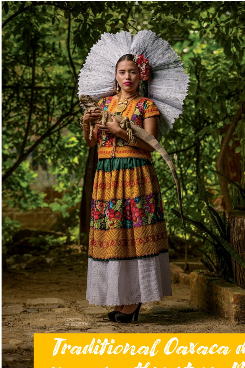
Traditional Oaxaca dress from southwestern Mexico