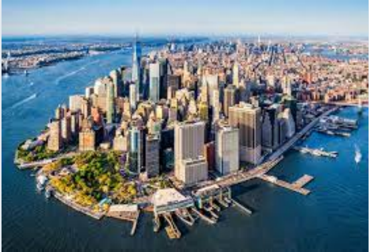
Dure Vie Family 11/02/2021