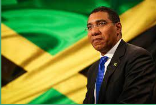
Jamaica's Prime Minister - Andrew Holness