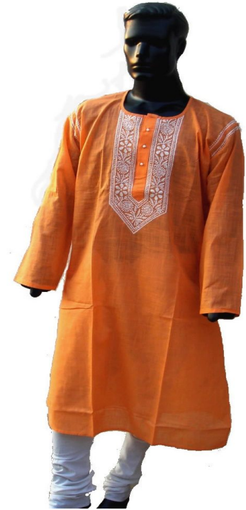
Guyanese religious clothing