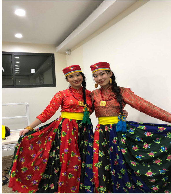
Nepali Cultural dance clothing