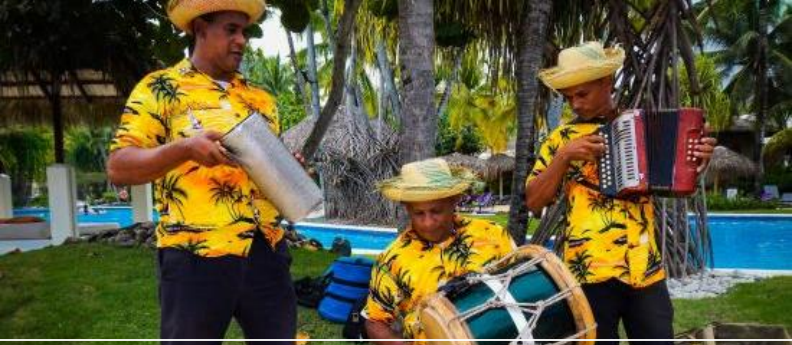
Dominican Republic Music