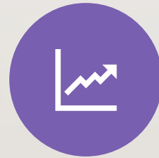
GRADUAL ADJUSTMENT STAGE