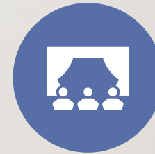
BICULTURALISM AND ADAPTATION STAGE