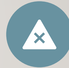
RE-ENTRY SHOCK STAGE