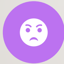
HOSTILITY AND IRRITABILITY STAGE