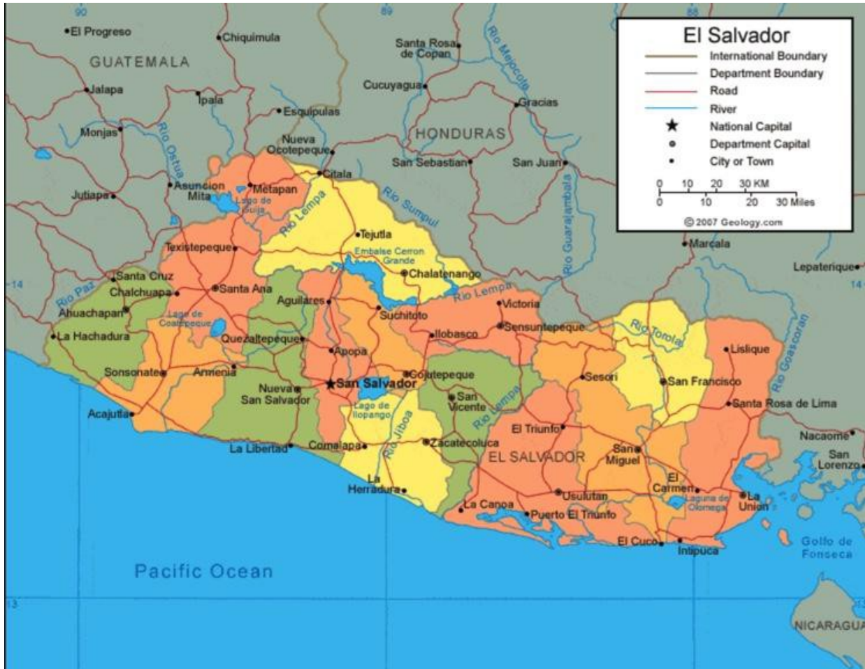
Map of El Salvador